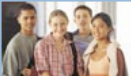
Schools, colleges and other educational facilities