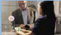
Banks and other financial institutions