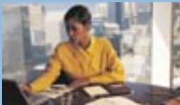
Commercial buildings including mixed-use facilities