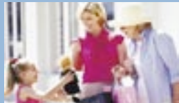
Shopping malls, stores, plazas and strip malls